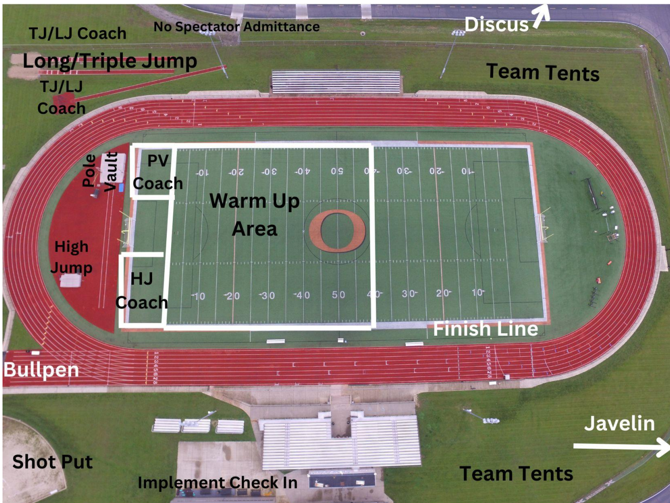
Shot Put and Discus