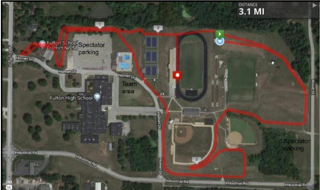
5000 meter course